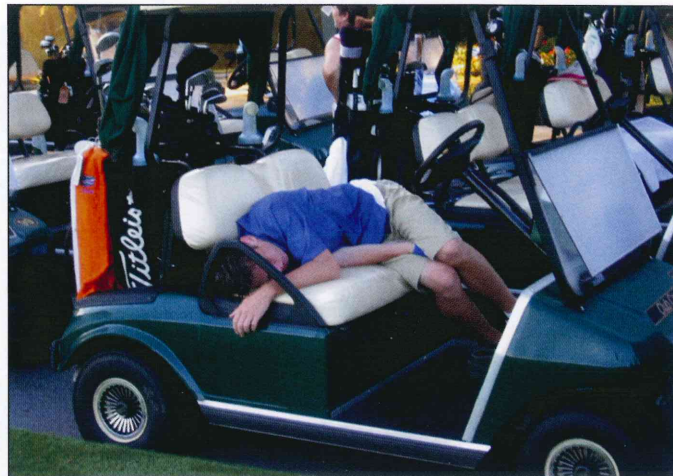
Late night at Disney World or was this golfer mentally preparing for round two?