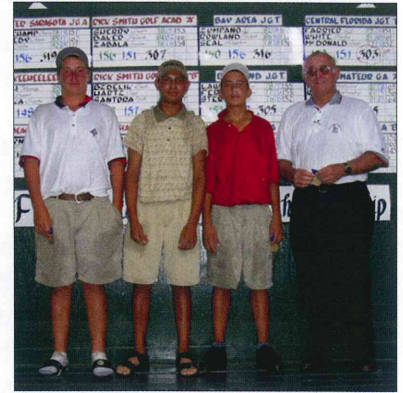
Boys 12-14 Champions: Dade Amateur Golf Association.