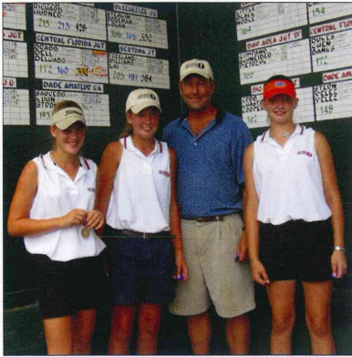
Girls 12-14 Champions: Bay Area Junior Golf Tour.