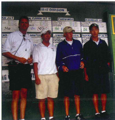
Boys 15-17 Champions: Central Florida Junior Golf Tour.